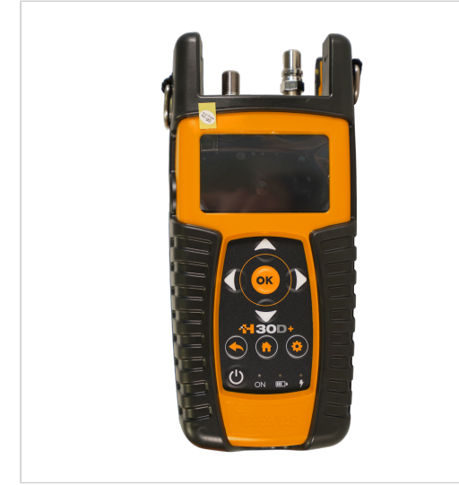
Televes reserves the right to modify the product